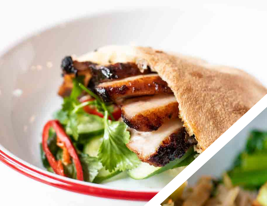
燒餅 (叉燒/時令) Char Siu Shaobing Seasonal Shaobing £6