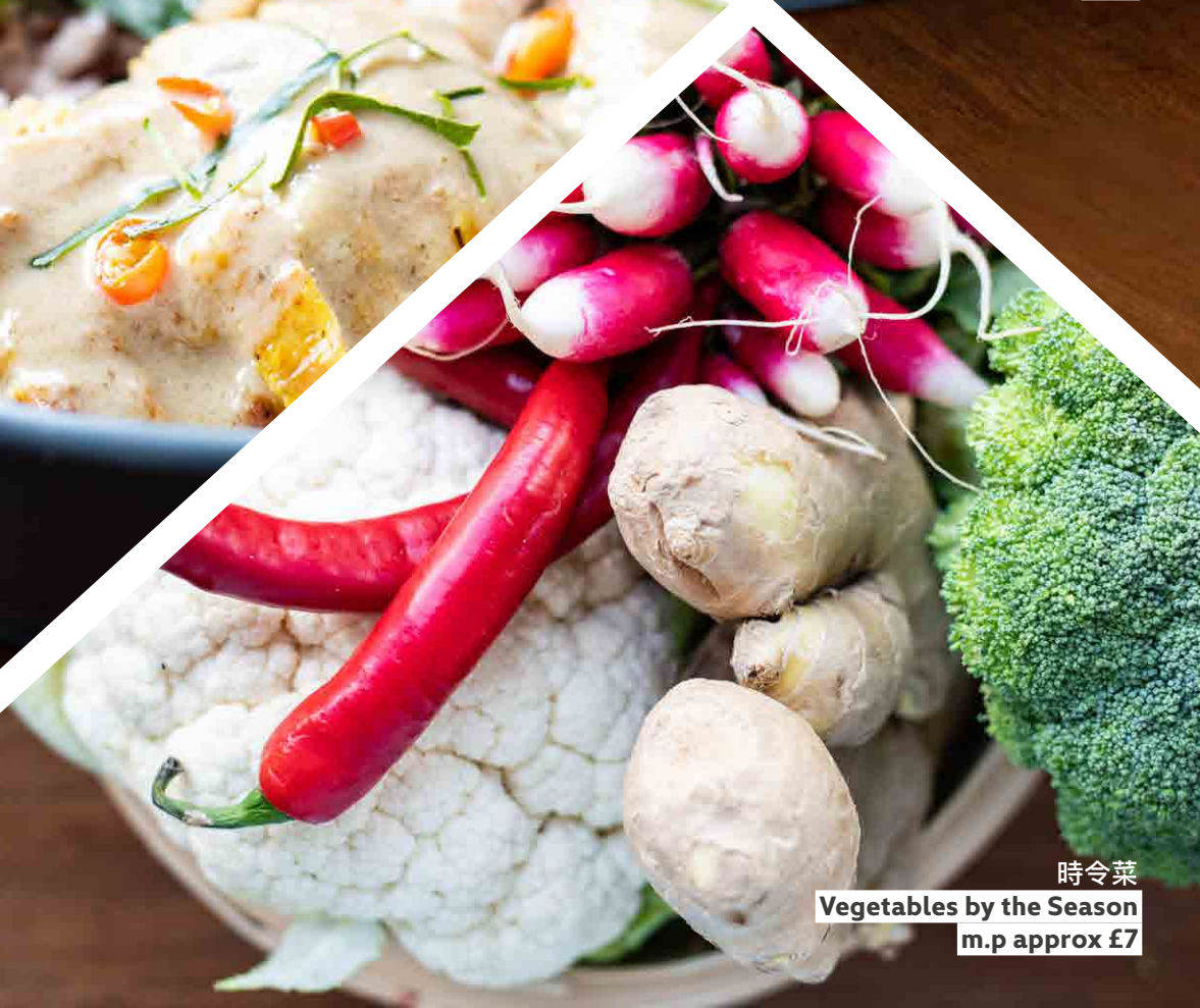
時令菜 Vegetables by the Season m.p approx £7