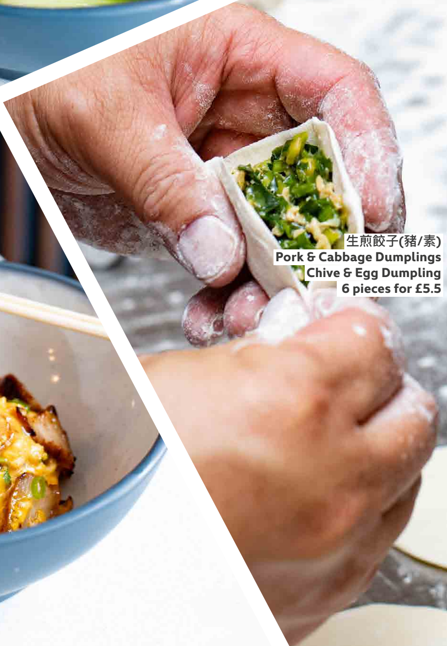
生煎餃子(豬/素) Pork & Cabbage Dumplings Chive & Egg Dumpling 6 pieces for £5.5