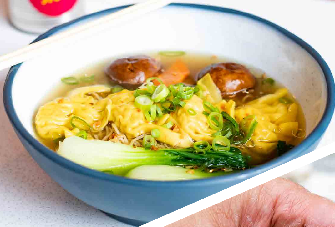
雲吞湯麵 Wonton Noodle Soup £7.5