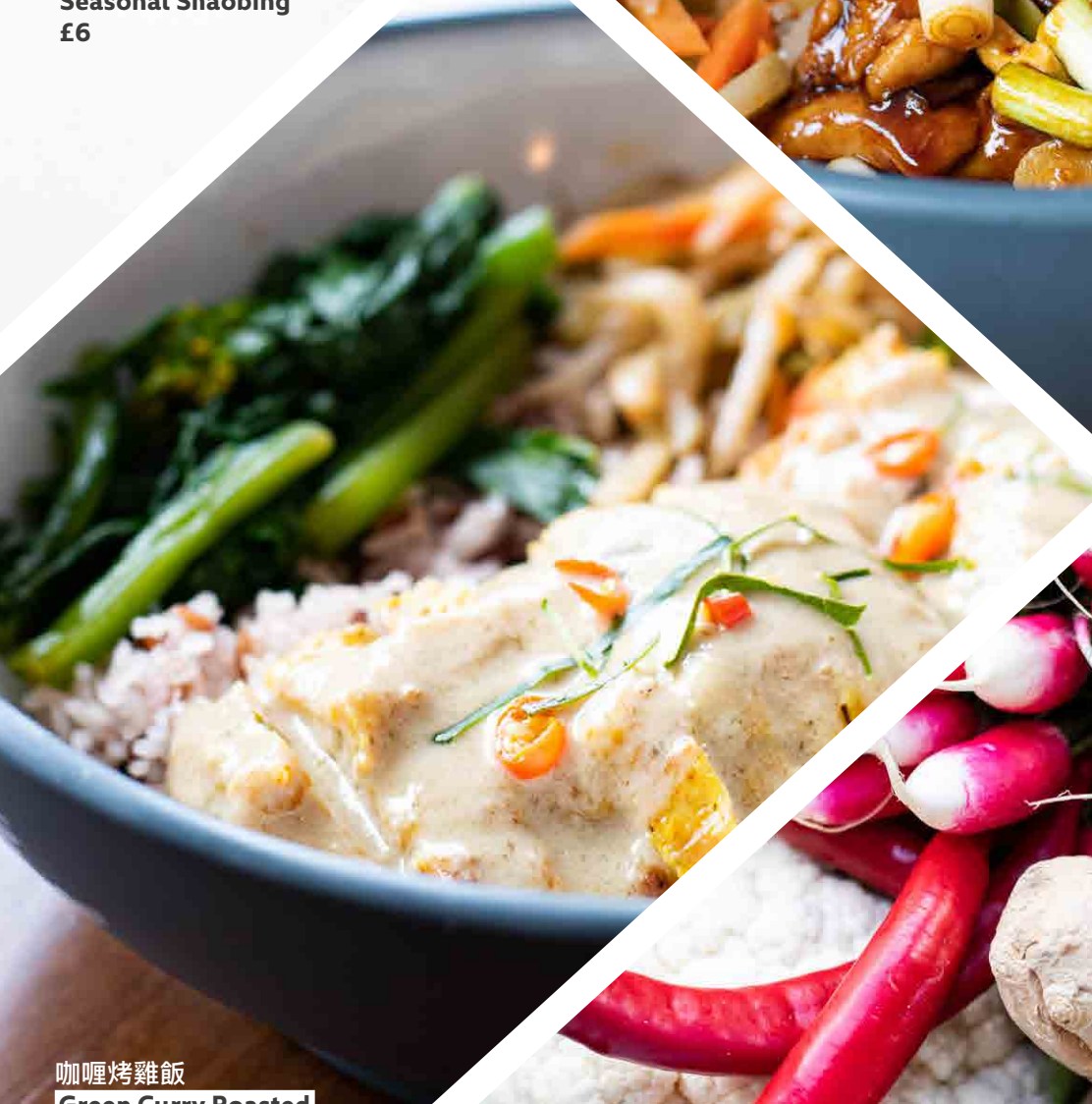
咖喱烤雞飯 Green Curry Roasted Chicken Rice Bowl £7.5