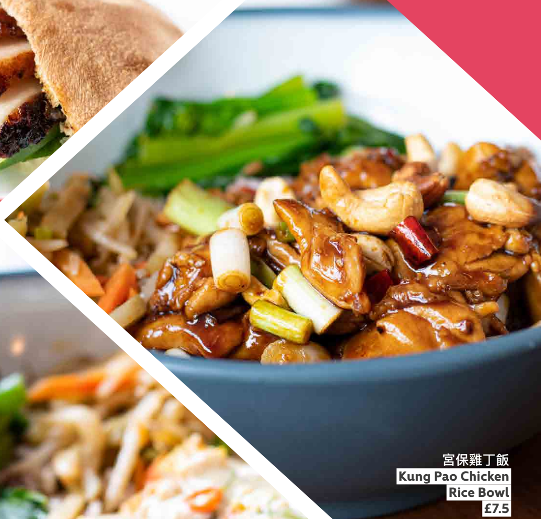
宮保雞丁飯 Kung Pao Chicken Rice Bowl £7.5